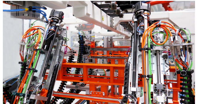
Bolting station x-bolt with bolting system x-gun